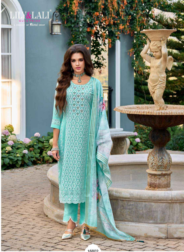
THE MODERN Enchantress