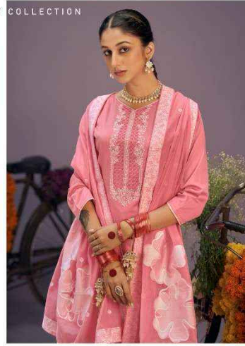
Embell yourself with an embroidered collection crafted with the finest materials and infused with divine grace.