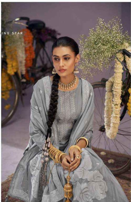
Her life is the shining star, she shines from the shloka angira, and she shines longest.