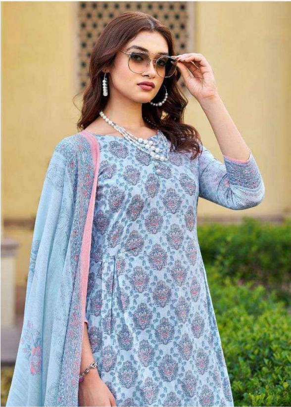
Just as wine ages with care, dresses need meticulous crafting and premium fabrics to express their excellence.