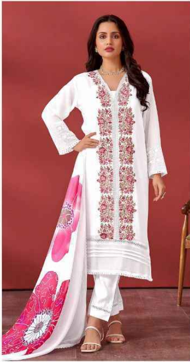
C - 1644