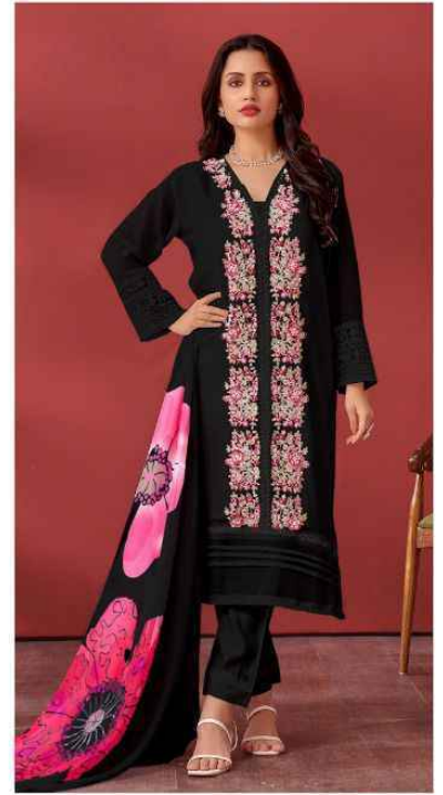
C - 1644 C