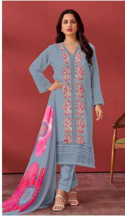
C - 1644 B