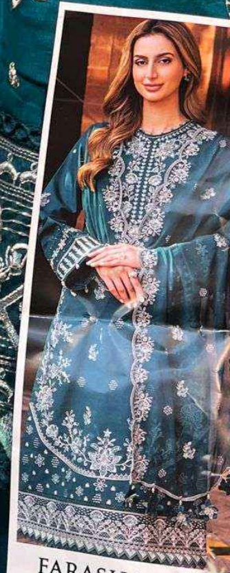
FARASHA VOL-2 TOP Cambrie Cotton With Heavy Embroidery Work