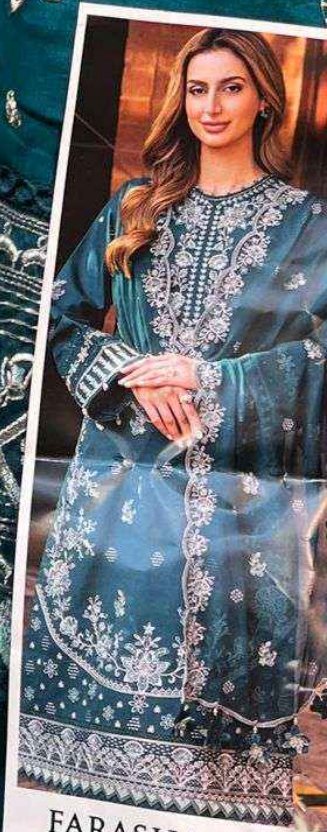
FARASHA VOL-2 TOP Cambric Cotton With Heavy Embroidery Work