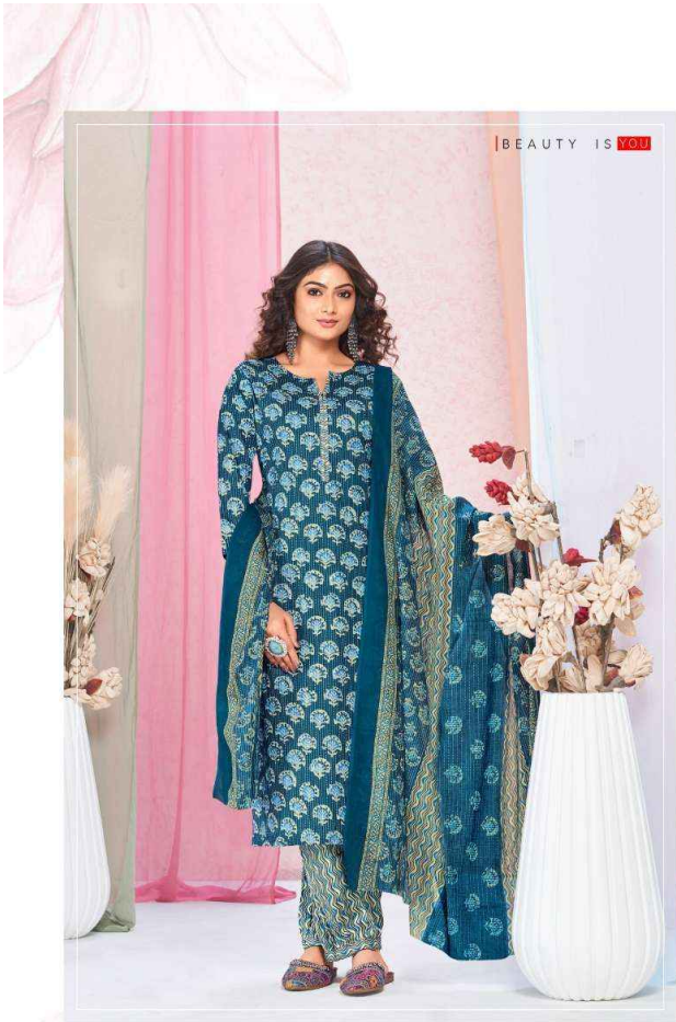
THE COLLECTION WAS A PERFECT BLEND OF INDIAN SILHOUETTES & CONTEMPORARY STYLE NO.3003