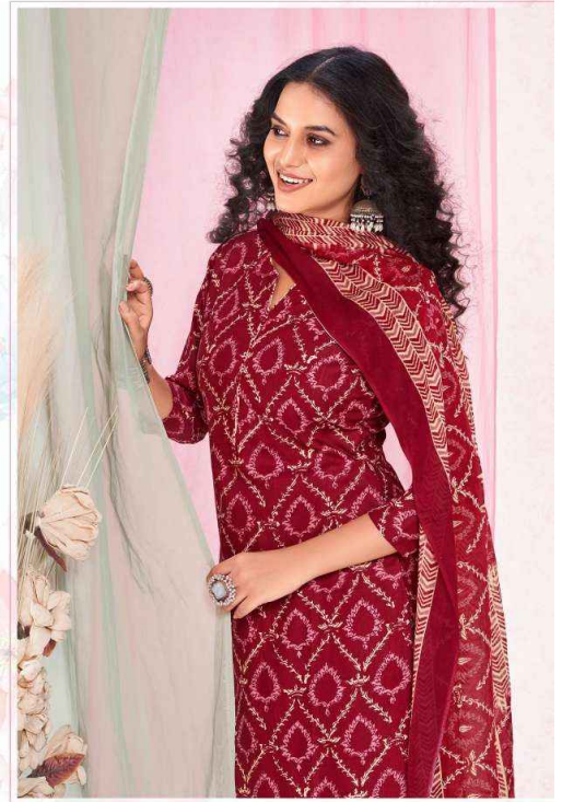
BE BEAUTIFUL WITH THIS MAGNETIC LOOK DESIGN AND MONOTONE COORDINATION. NO. 3006