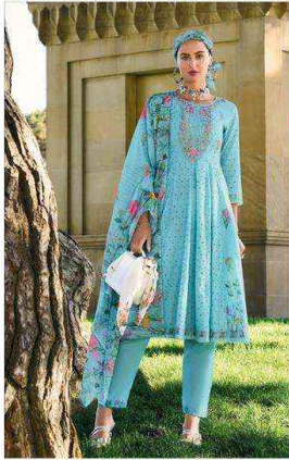
* 42713 *