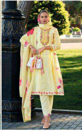
* 42712 *