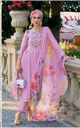
* 42714 *