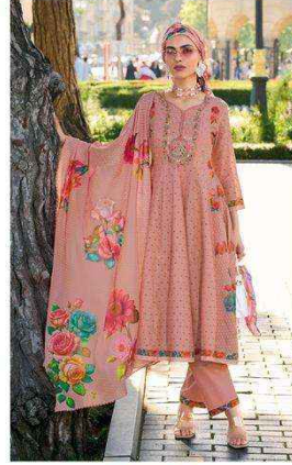
* 42715 *