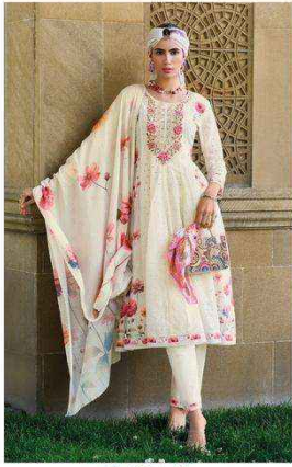
* 42711 *