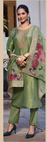
SILK AFFAIR 3836