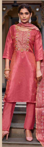
SILK AFFAIR 3834