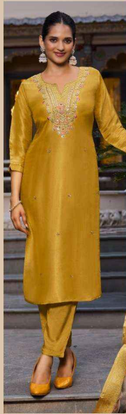
SILK AFFAIR 3833