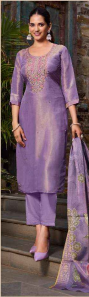
SILK AFFAIR 3832