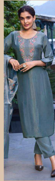
SILK AFFAIR 3835