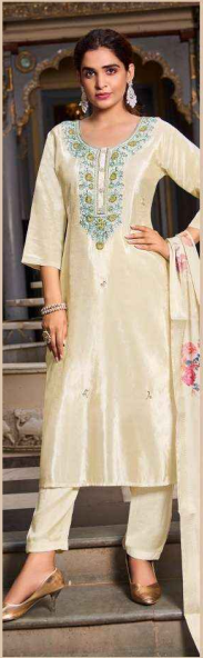
SILK AFFAIR 3831