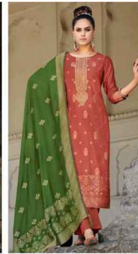
830-005 ■ ■ ■