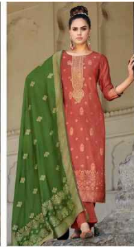
830-005 ■ ■ ■