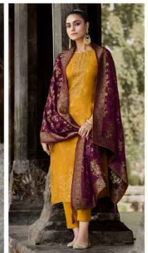
830-006 ■ ■ ■