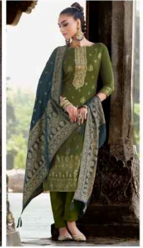
830-003 ■ ■ ■