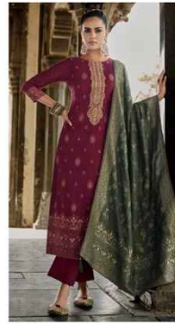
830-004 ■ ■ ■