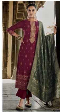
830-004 ■ ■ ■