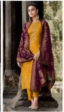
830-006 ■ ■ ■