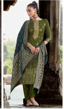
830-003 ■ ■ ■