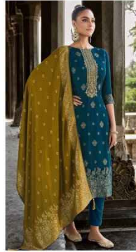
830-001 ■ ■ ■