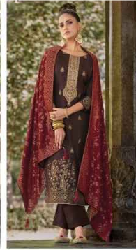
830-002 ■ ■ ■