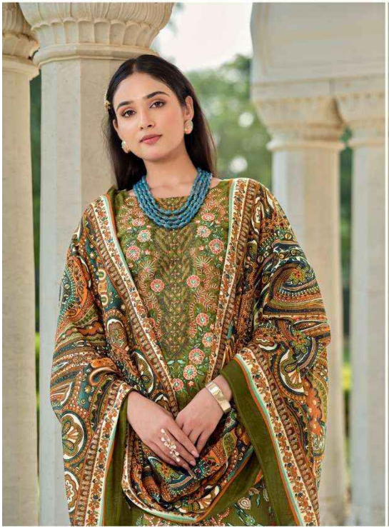
970-007 "What you wear is how you present yourself to the world, especially today, when human contacts are so quick. Fashion is instant language."