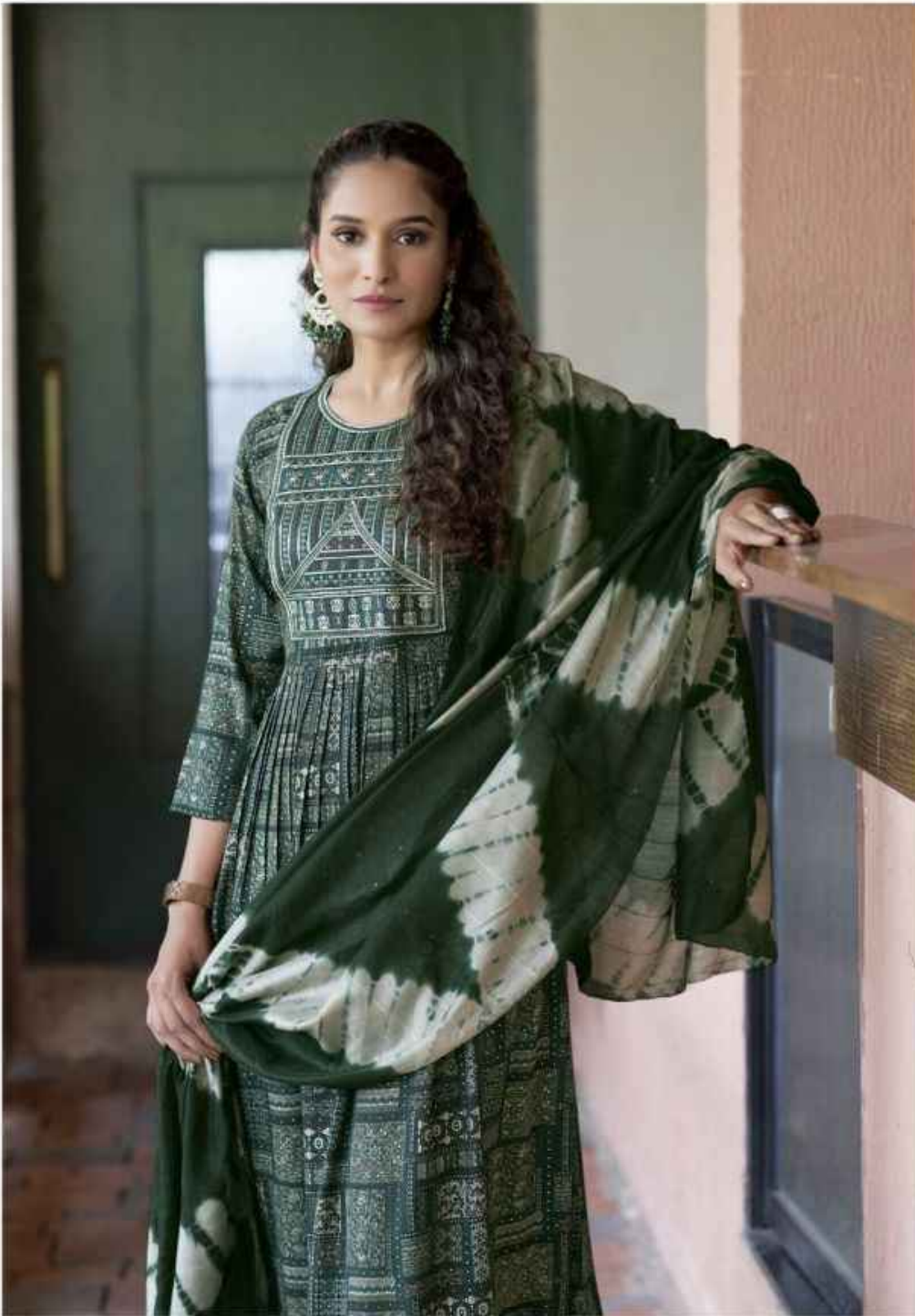
Kurti (Tunic/Top) is just a womens top. Girls nowadays wear Kurti over jeans, Salwar, Pant, Capri and even a skirt. Indian Kurtis(Tunic/Tops) are accepted worldwide. Kurtis (Tunic/Top) look decent and sincere, versatile and stylish, trendy yet modest.