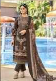
EMBROIDERY: Kashmiri Heavy Neck & Daman With Stich