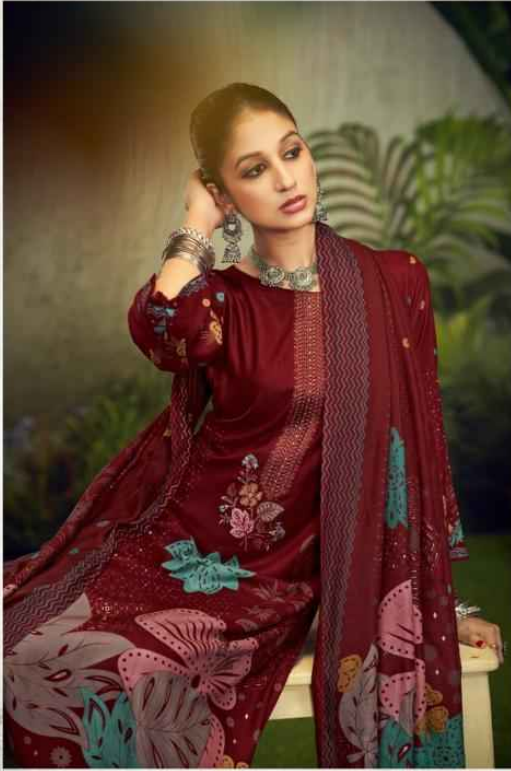
A MAJESTIC CHARM Unveiled