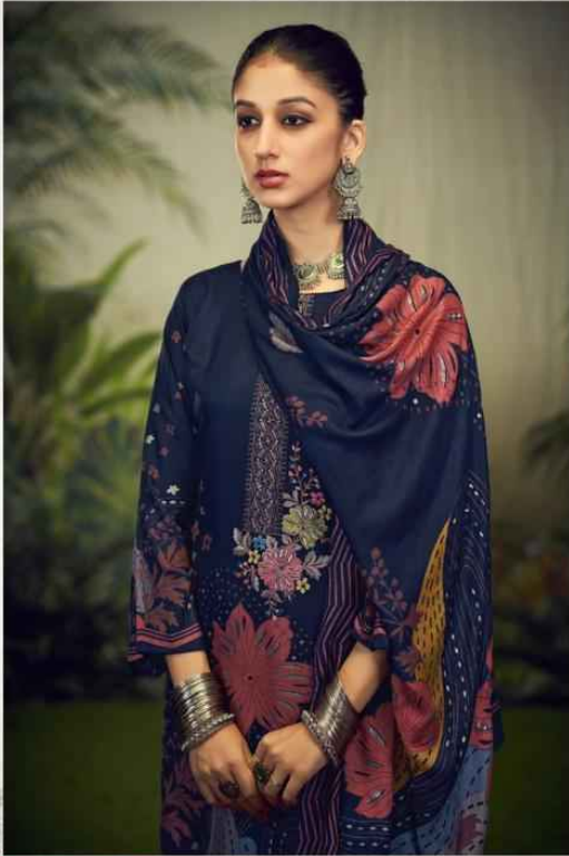
MAJESTIC BEAUTY Chander & Craft