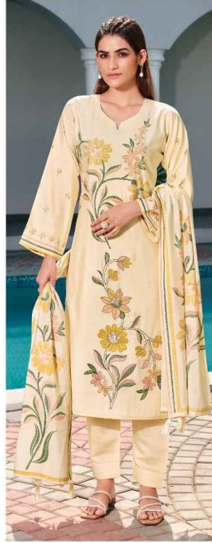
•3003• ■■■■ AARZOO