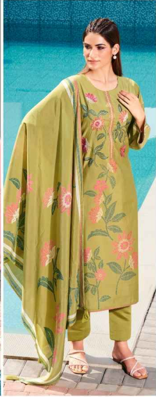
•3002• ■■■■ AARZOO