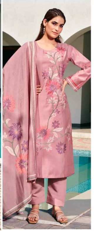
•3004• ■■■■ AARZOO