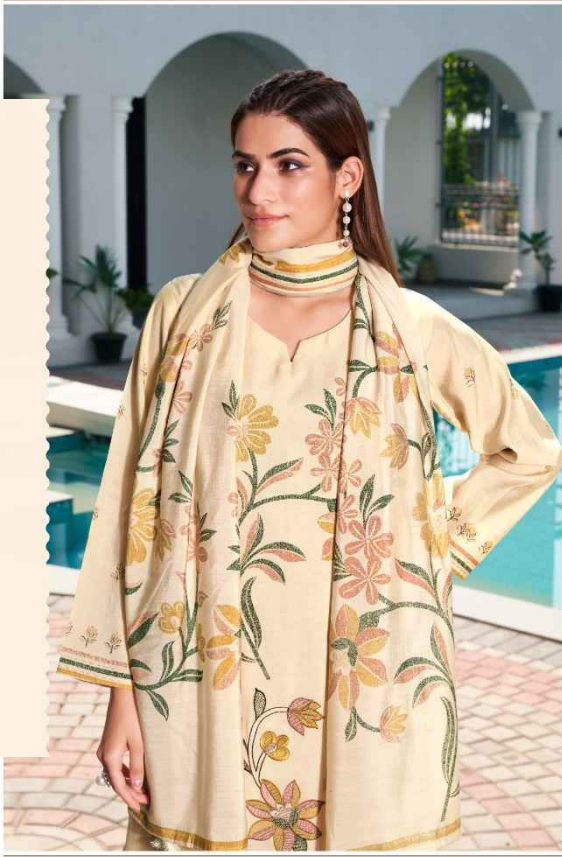
AARZOO • 3003 •

Stop by for a look at your comfortable design and delicate embellishments.