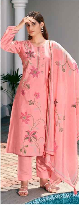
•3001• ■■■■ AARZOO