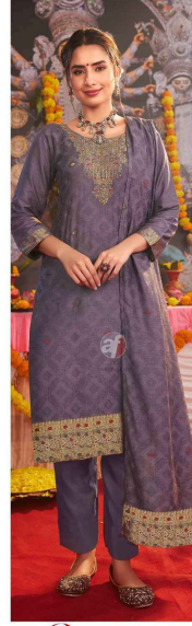
PALKI Vol-04 4044