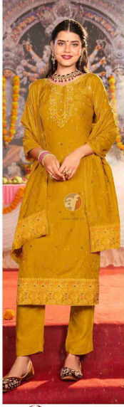
PALKI Vol-04 4042