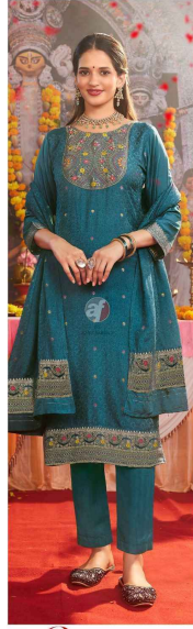
PALKI Vol-04 4043