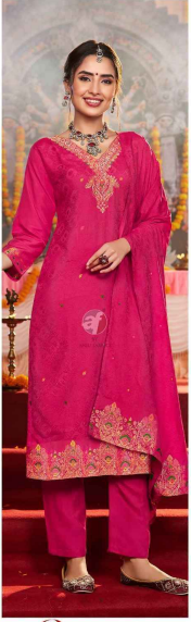
PALKI Vol-04 4041