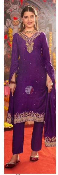
PALKI Vol-04 4046