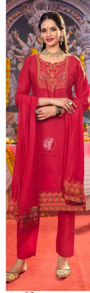
PALKI Vol-04 4045