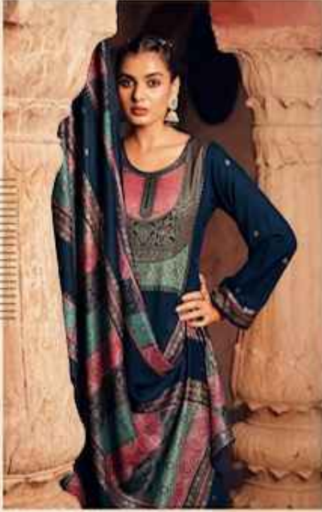
FLORIAN V. WINNERS COLLECTION