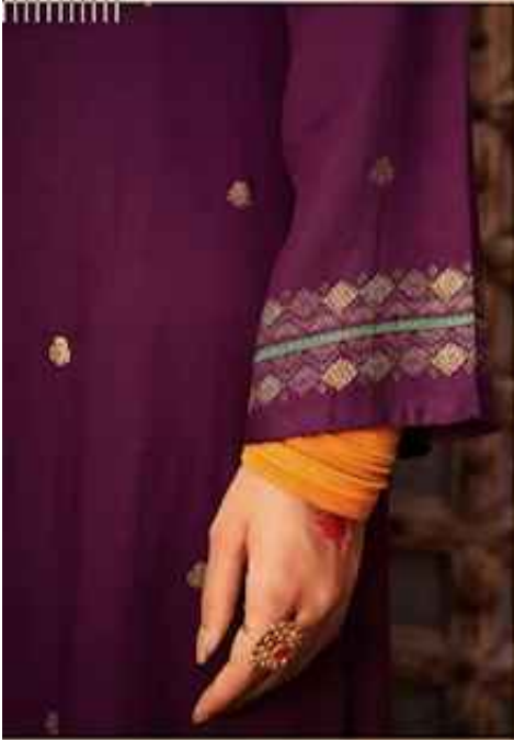
LEAFY'S BIRROST GREEN 1008 8000