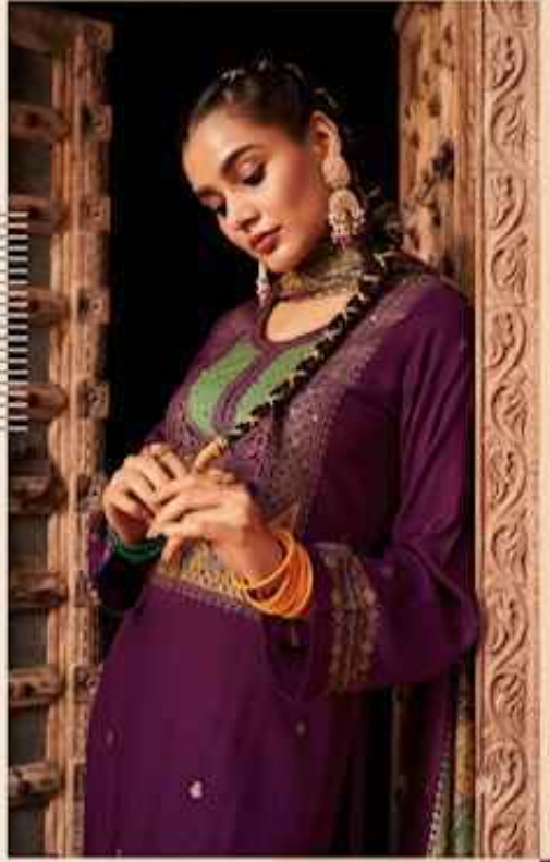
RUUPALI'S WINTER, 2022-23 504