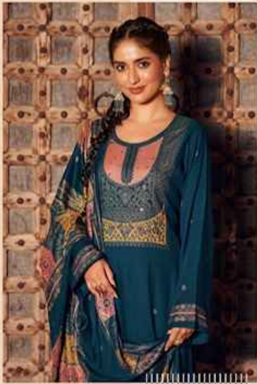
100% N. COTTON 42000