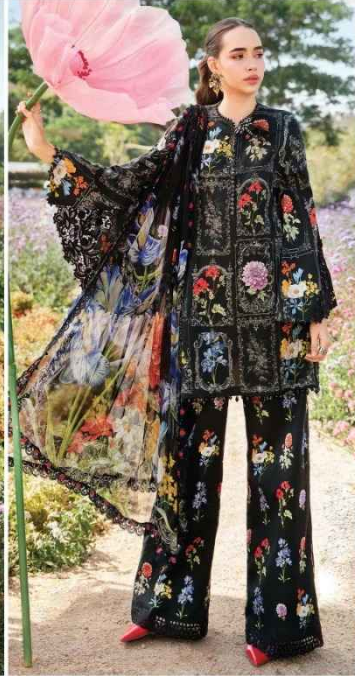
D NO 17002