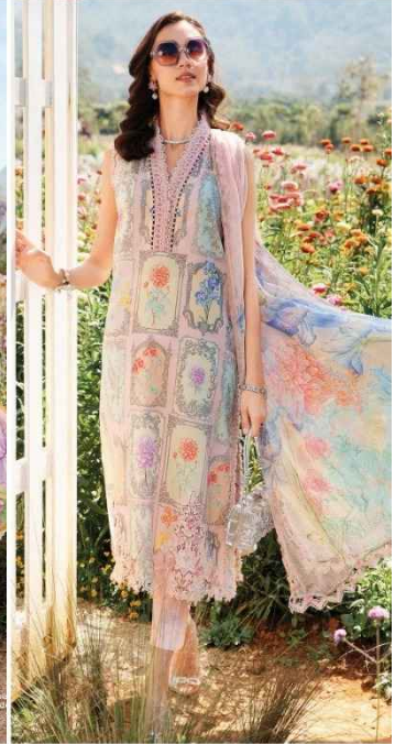
D NO 17004