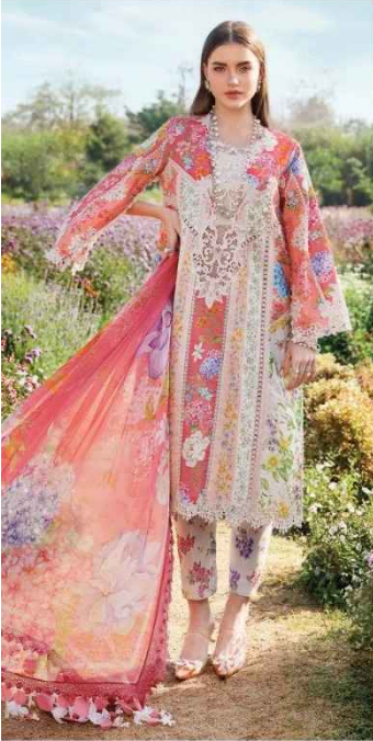
D NO 17001