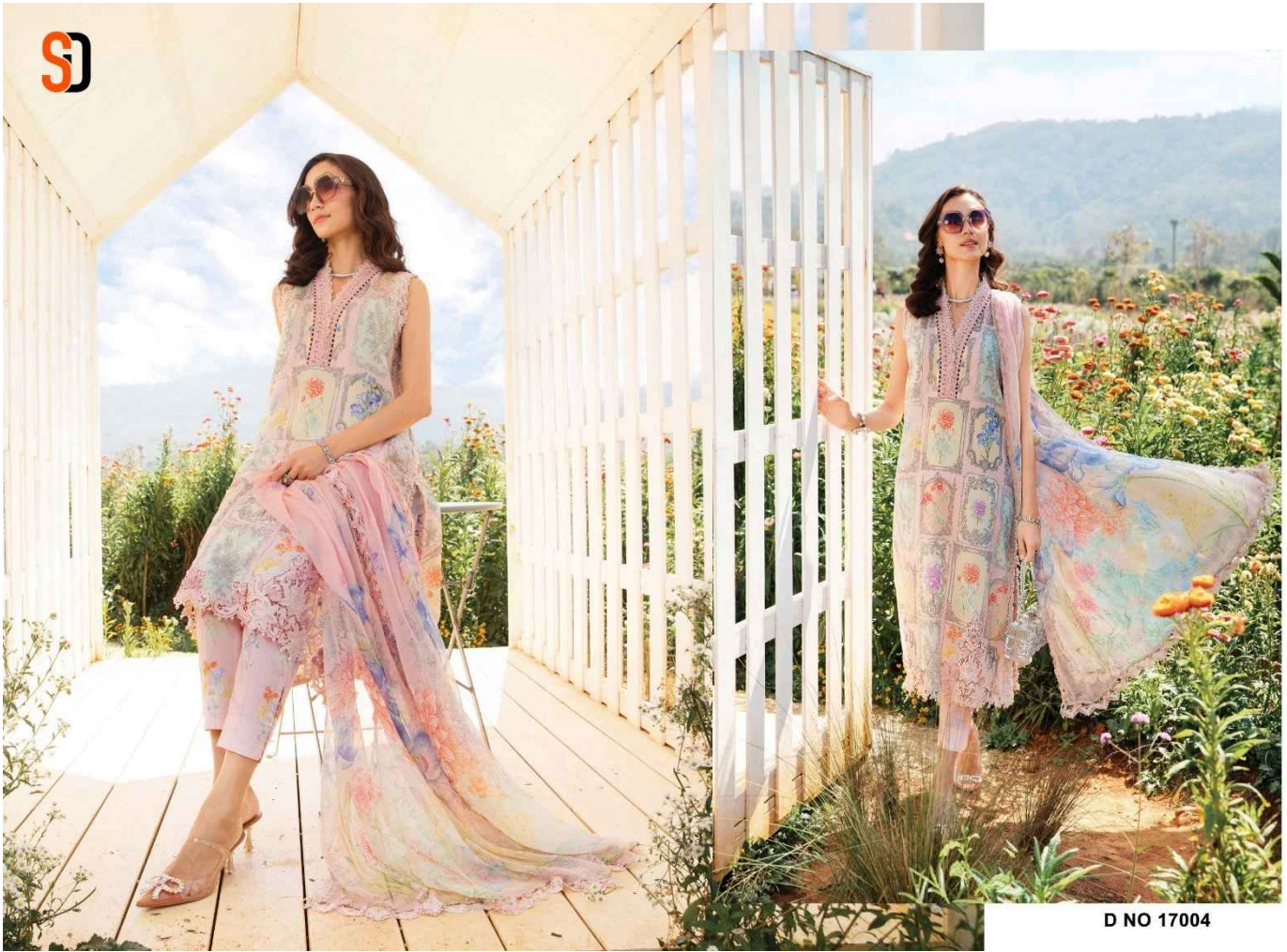
D NO 17004