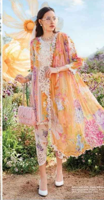
D NO 17003