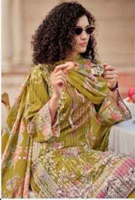
The Spirit of India, Revived in Threads Code # 1000001