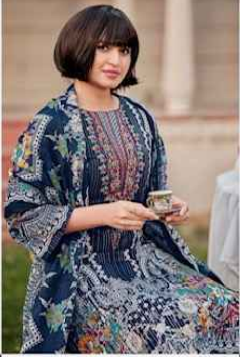
Thousands of Blessings, Kitted for You Code # 1886001