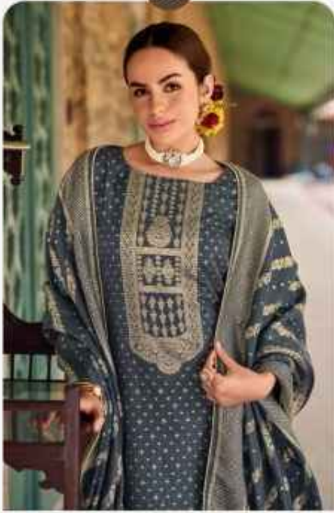
Inspired by history, designed for now. A modern silhouette with an ethnic soul. Fabric that flows like a river's song. To every heart, the heart that sings.