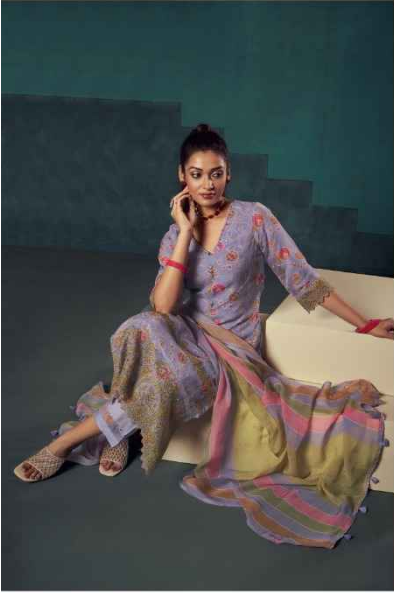
Splendid motifs and grandeur appeal make this silk of sarees wow-worthy. Get all the ethereal and earthy looks here.