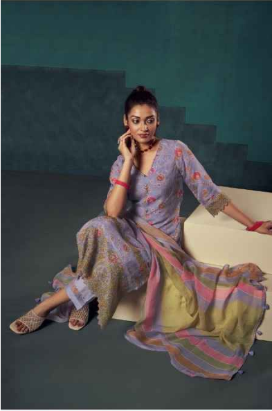
Splendid motifs and grandeur appeal make this silk of sarees wow-worthy. Get all the ethereal and earthy looks here.