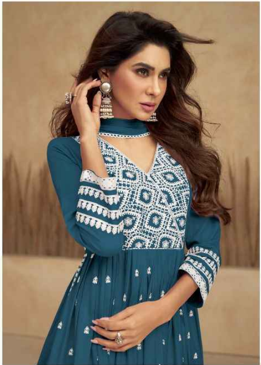
❖ 1107-I ❖