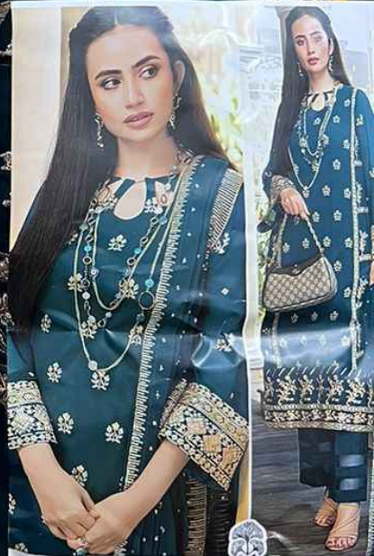
KHUSHBU Vol-7 ZAHA D.N TOP: Faux Georgette with Embroidery BOTTOM-INNER Dull santoon DUPA