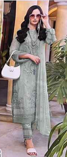
KHUSHBU ZAHA D.No.10151 DUPATTA Nazmin Chiffon with Embroidery