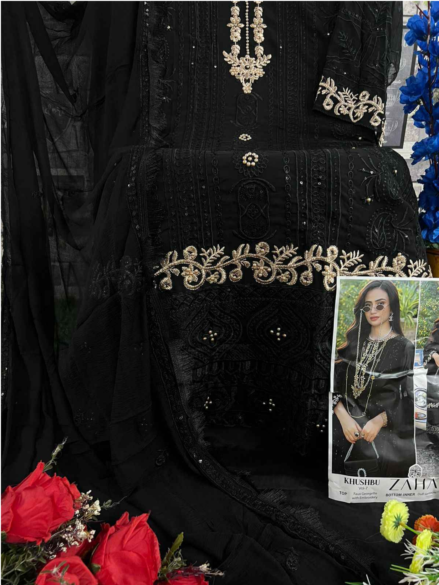
KHUSHBU ZAHA Vol. 7 TOP Faux Georgette with Embroidery BOTTOM-INNER Dull sarisone