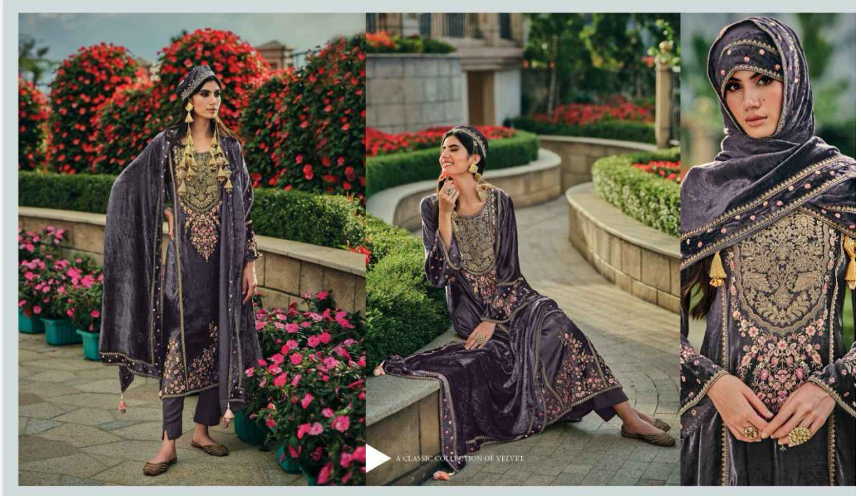
A CLASSIC COLLECTION OF VELVET